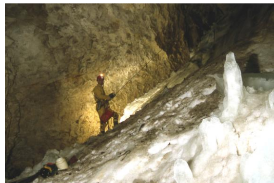
Descending into the “main chamber”