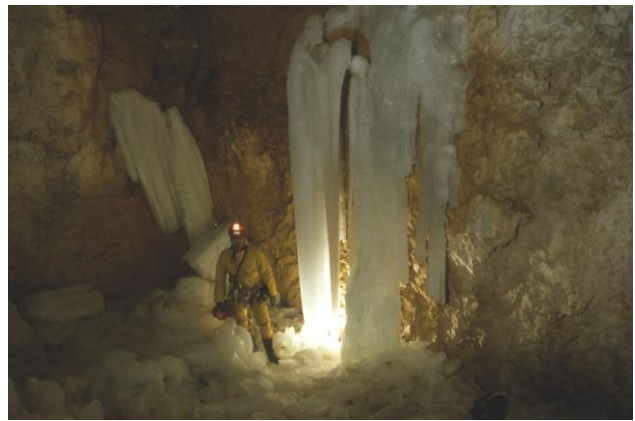
Ice formations in the “main chamber”