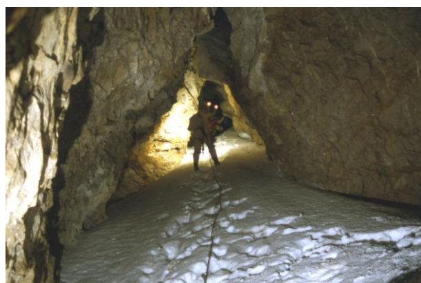
Descending the "Bell" pitch