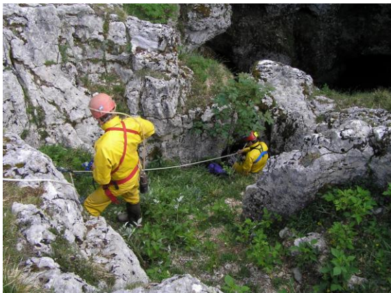
Rigging the entrance "eyehole"

EQUIPMENT: 100ft rope for surface shaft, 150ft will be enough for the other shafts. Take hangers and slings as existing Spits are old and few.