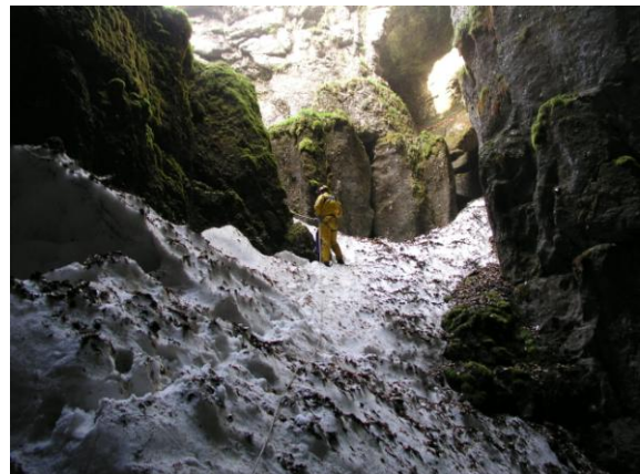
The top of the snow plug