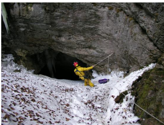
Rigging the "slot"